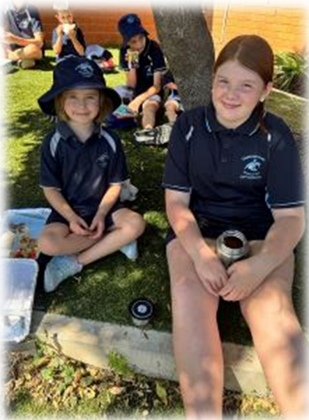
Preps with their Grade 6 Buddies